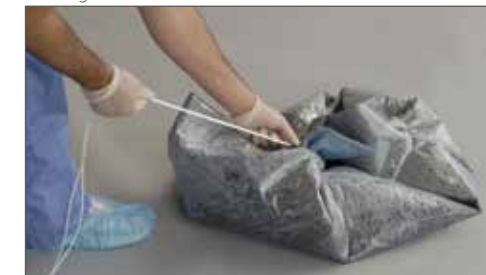
A Cinch Mat showing usage of the draw string cord