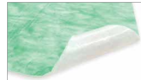
Surgisafe Absorbent Floor Mat with a fluid barrier non-slip backing